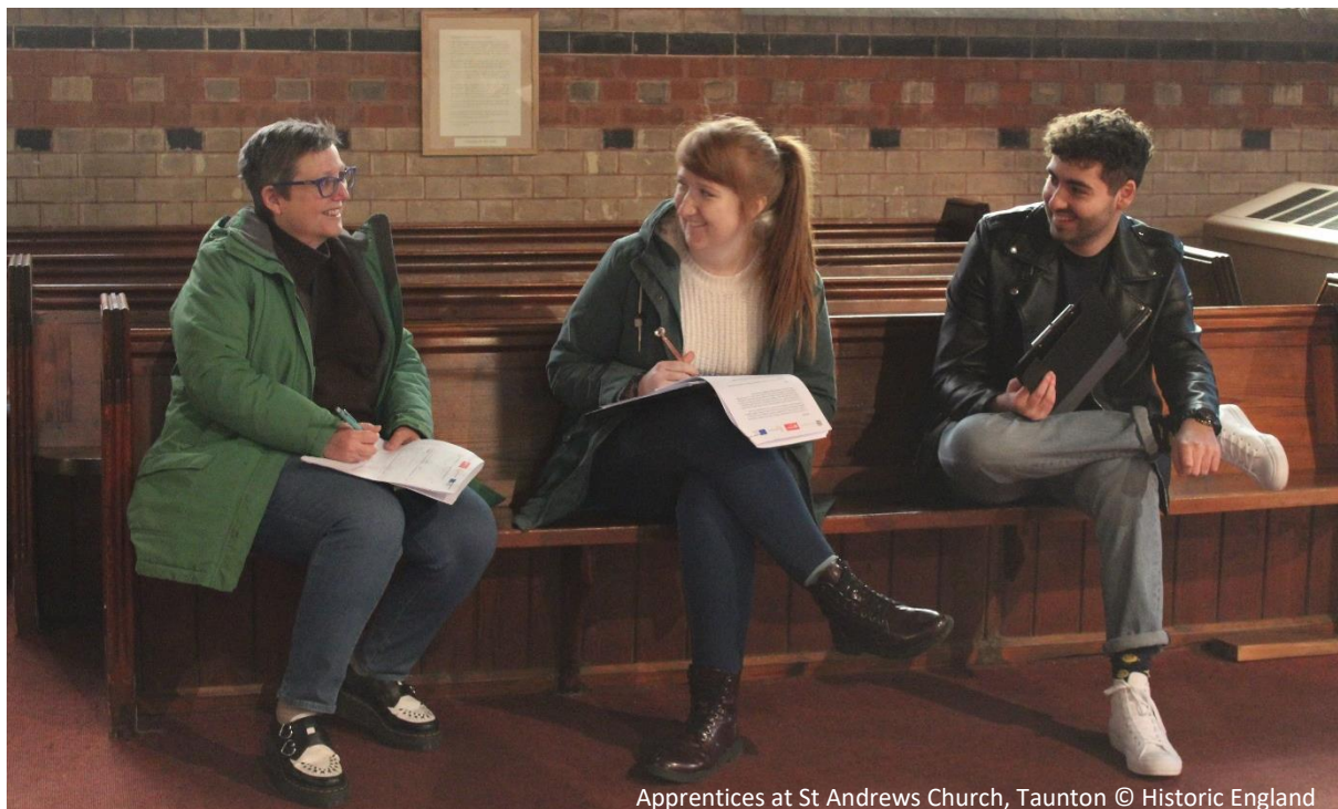
Apprentices at St Andrews Church, Taunton

If you pay the Apprenticeship Levy you can claim it back to pay for their training and, if you don't, you can still claim 95% of training costs. At the moment the government is offering financial support for employers taking on apprentices https://www.gov.uk/employing-an-apprentice/get-funding and has announced more support and flexibility for apprenticeships through Covid-19 and ahead.