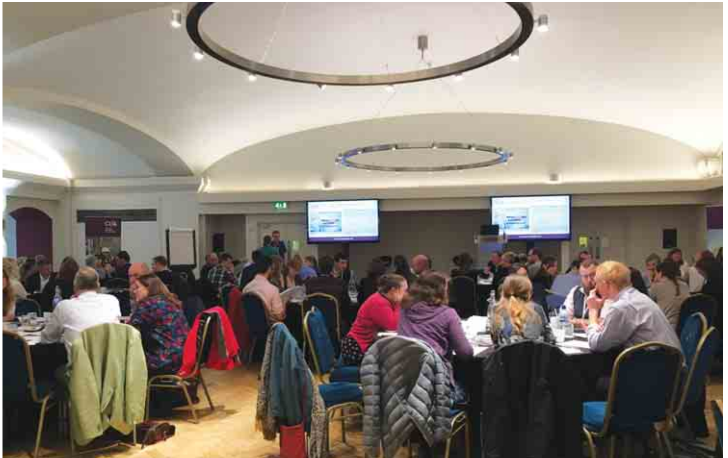
Group discussions.