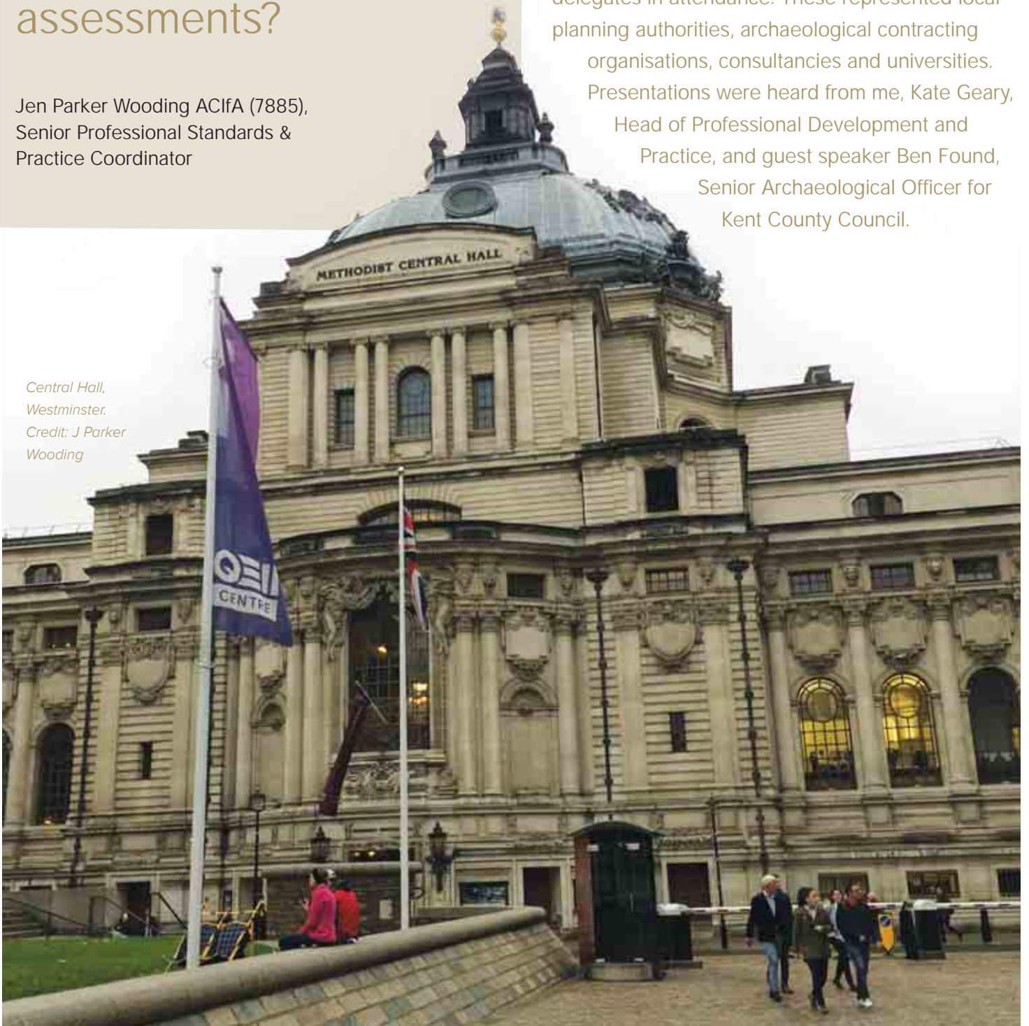
Central Hall, Westminster.