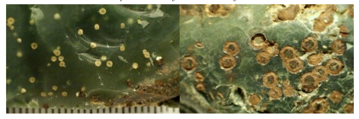
Figs 4-5. 4) Fresh inner surface showing white, unweathered globules. 5) Weathered outer surface showing discoloured, rust-brown globules; several globules in this group have fallen out – the semi-spherical cavities left by detached globules are as geologically diagnostic as the globules themselves. Both pieces of bloodstone were collected in Guirdil Bay, Rhum, by Steven Birch, West Coast Archaeological Services, and donated to TBB's bloodstone research.