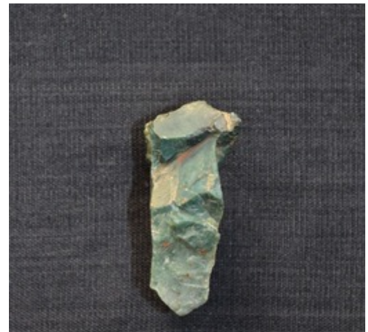
Figs 9-10. CAT 1639 – note the large globule centre left.

All three pieces were recovered from fields near the present coast-line, in the area around the Tarradale shell middens (Fig. 2). The fact that CAT 1081 is heavily water-rolled suggests a date prior to the Main Holocene Transgression which occurred towards the end of the Mesolithic period, around 5630-5440 cal BC (Ballantyne & Dawson 1997).