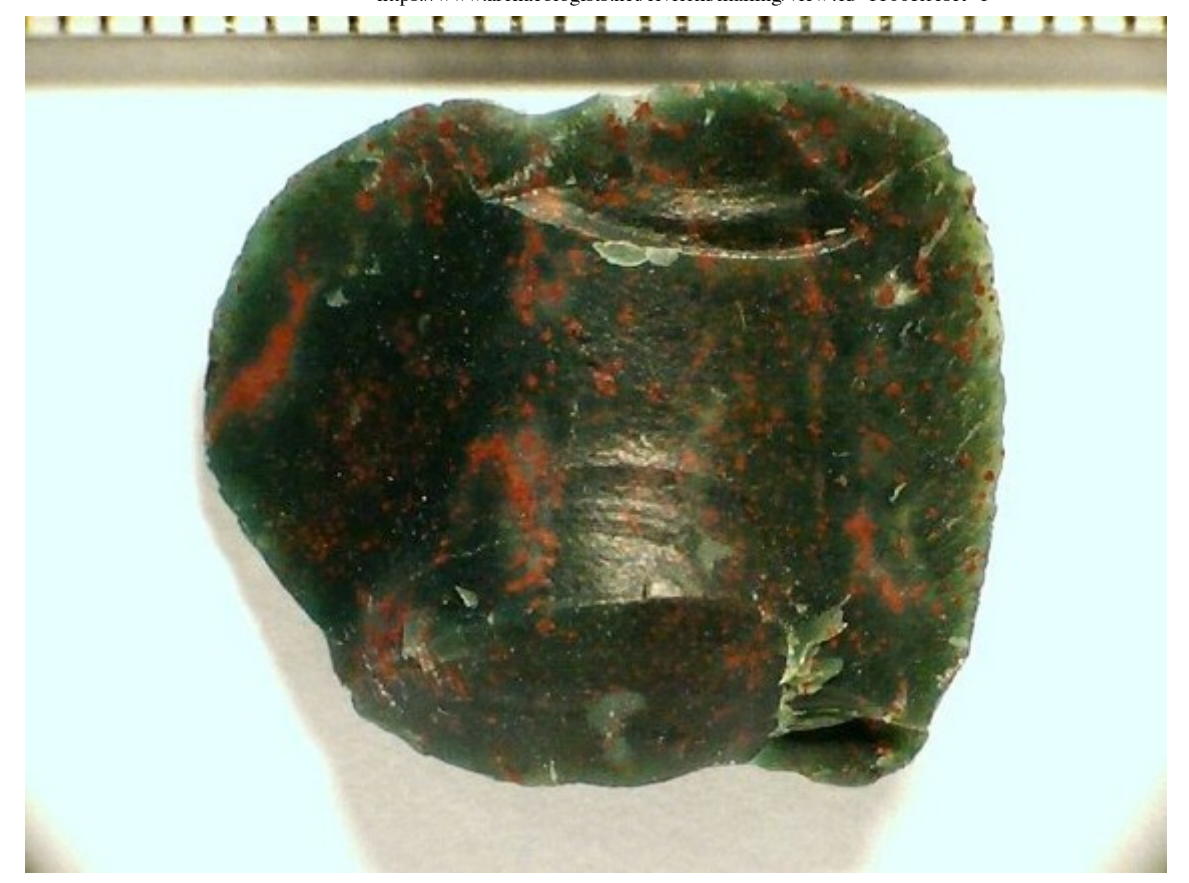
Fig. 3. Flake of gem-quality bloodstone showing the characteristic red spots and filaments. Purchased by TBB in jewellery shop.