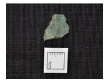
Fig. 6. CAT 823 – note the two globules towards the lower left corner of the piece.