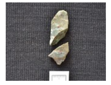
Figs 7-8. CAT 1081 – note the numerous small globules.